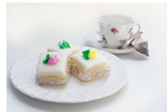
White Petit Fours

Downtown Torrance 1341 El Prado Avenue Torrance, CA 90501 (310) 320-2722 info@torrancebakery.com